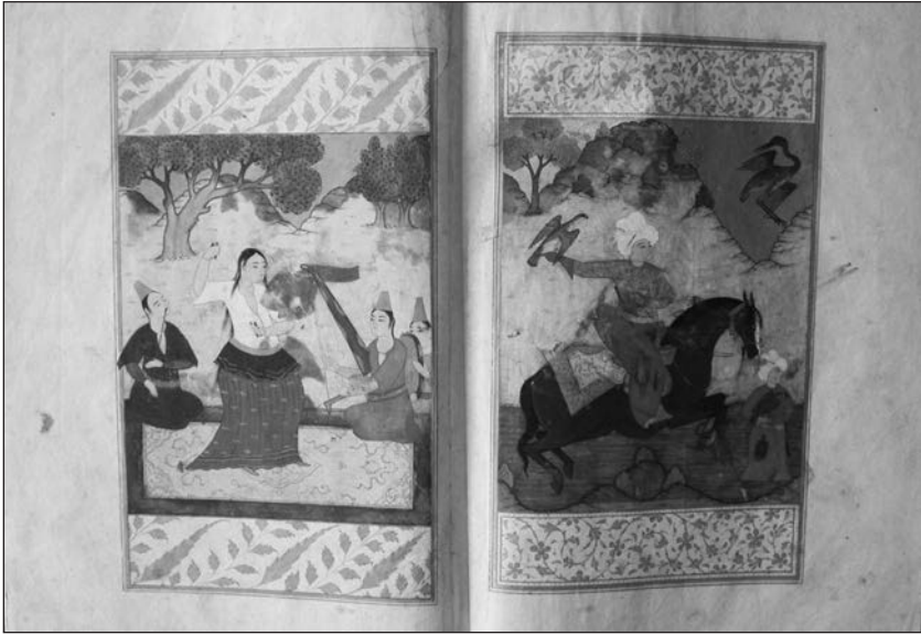
Figure 3a. Tuhfetü'l-mülük ve's-selâtin : İstanbul, Topkapı Palace Library H. 415 (ca. 1610), 240b-241a. Women's outdoor entertainment and hunters.