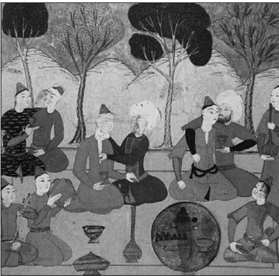
Figure 2b. Tercüme-i Miştâh Cifrü'l-Câmî : İstanbul, İstanbul University Library, T. 6624. Men and women feasting in a garden under trees.