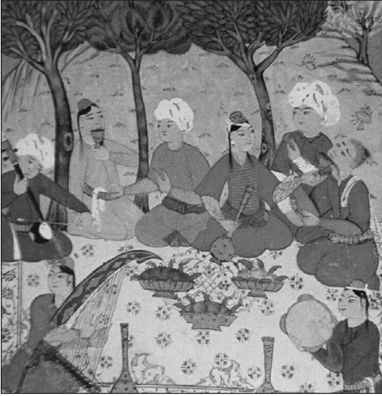
Figure 2a. Tercüme-i Miştâh Cifrü'l-Câmî : İstanbul, Topkapı Palace Library B. 373 (1597-98), 243b. Men and women feasting in a garden under trees.