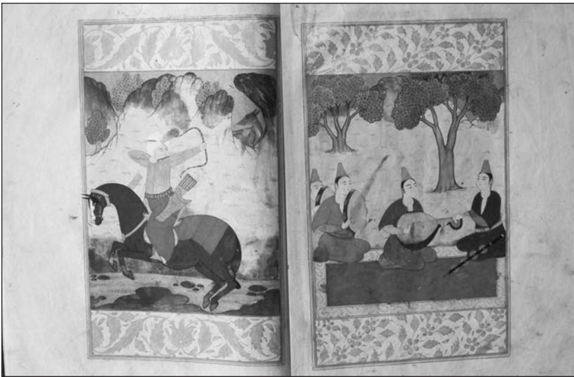
Figure 3b. Tuhfetü'l-mülük ve's-selâtin : İstanbul, Topkapı Palace Library H. 415 (ca. 1610), 241b-242a. Women's outdoor entertainment and hunters.