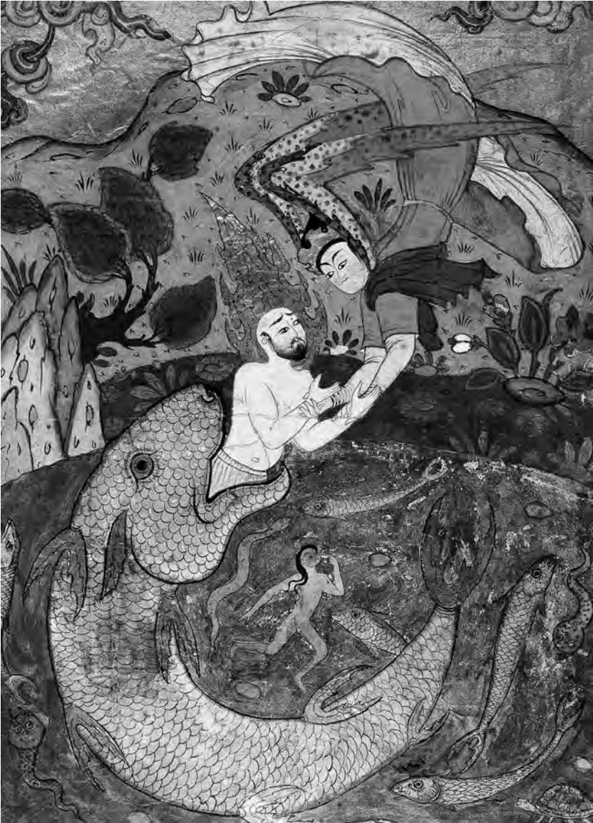
Figure 19.3 Jonah being helped out of the belly of the fish by an angel: Falname , Topkapı Palace Museum Library, H. 1703, 35b.