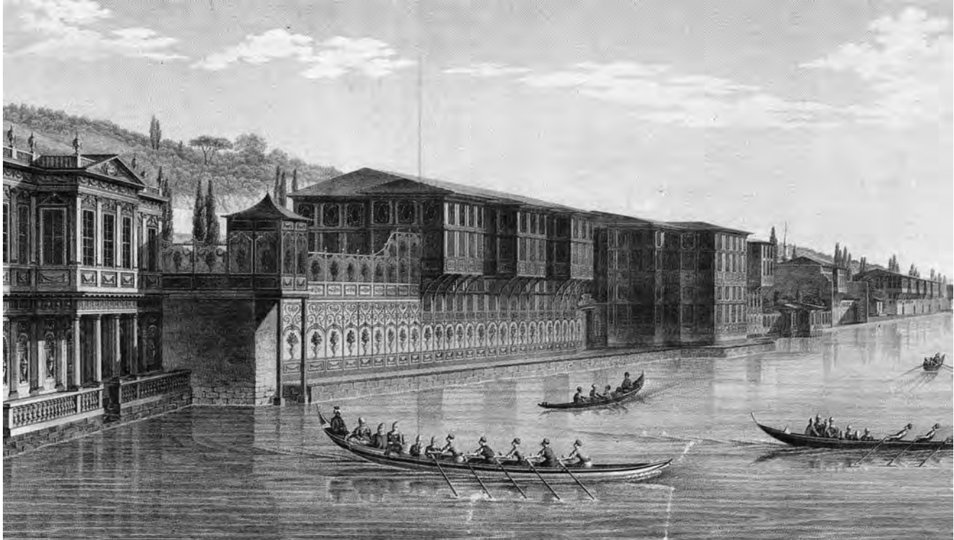
Figure 19.13 Hadîce Sultân's Defterdarburnu Palace by Antoine-Ignace Melling, in Voyage pittoresque de Constantinople et des rives du Bosphore , Paris, 1819.