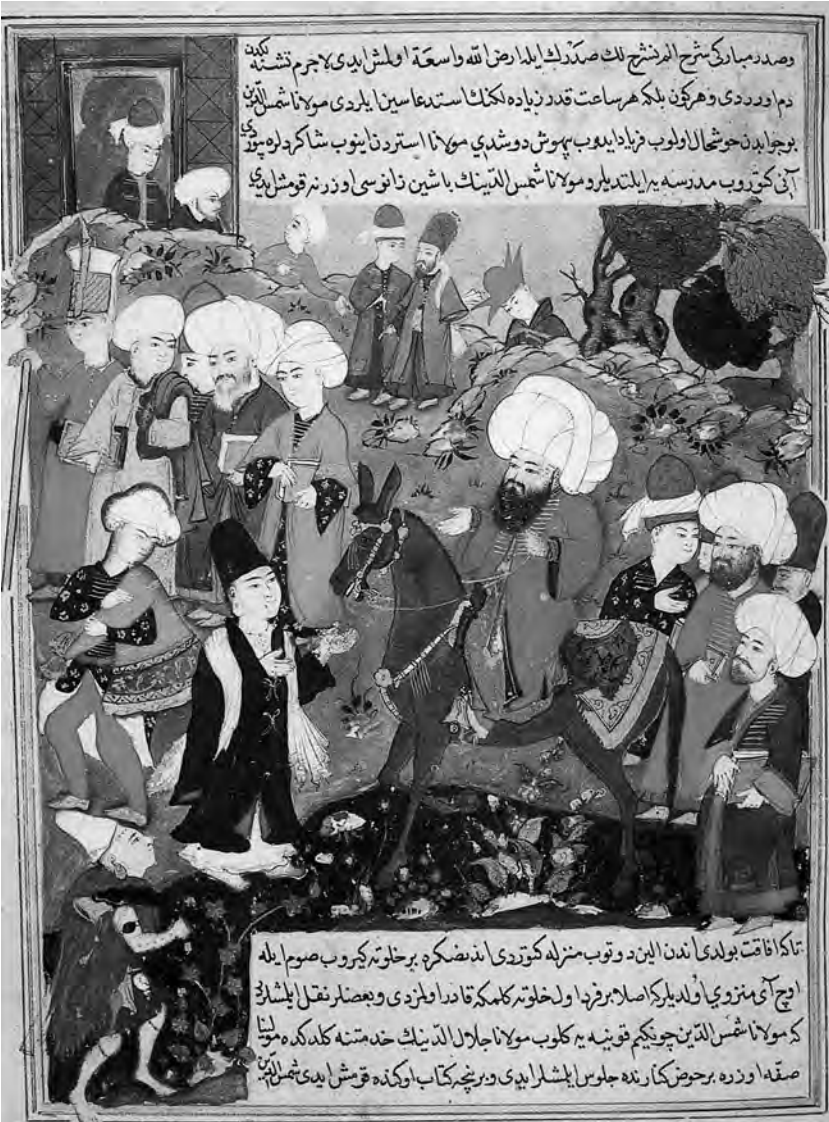
Figure 19.1 Mevlânâ Celâleddîn Rûmî's encounter with his consecrator Semseddîn of Tabriz, a 'wild' mystic, in Konya: Câmîû's-siyer , Topkapı Palace Museum Library, H. 1230, 112a.