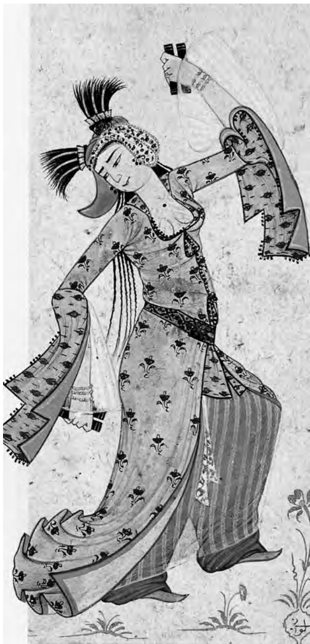
Figure 19.9 A dancing-girl, by Abdülcelil Levnî: Album, Topkapı Palace Museum Library, 2164, 18a.