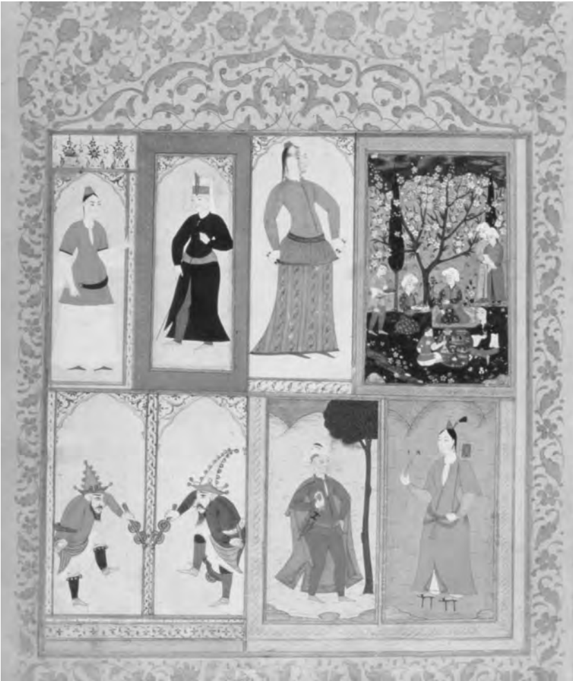
Figure 19.4 Miniatures from the Album of Ahmed I: Topkapı Palace Museum Library, B. 408, 16b.

Nu'mâniye (c. 1619). This volume includes miniatures showing these long-dead luminaries either alone or else along with their colleagues, students or the sultans of the times – always seated, and preferably outdoors. The artist responsible for the illustrations of the Tercüme-i Şakâyk-i Nu'mâniye has identified himself as Nakşî (Ahmed) Bey (d. after 1622) in connection with a miniature at the end of the volume, in which the artist had represented himself together