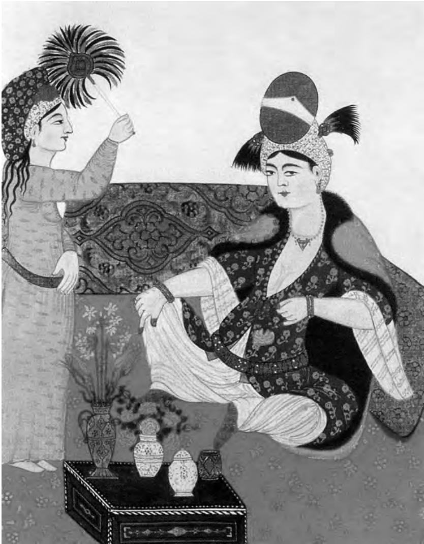
Figure 19.8 Haseki Sultân with attendant, by Musavvir Hüseyin: Album, Bibliothèque Nationale Od. 7, pl. 20.