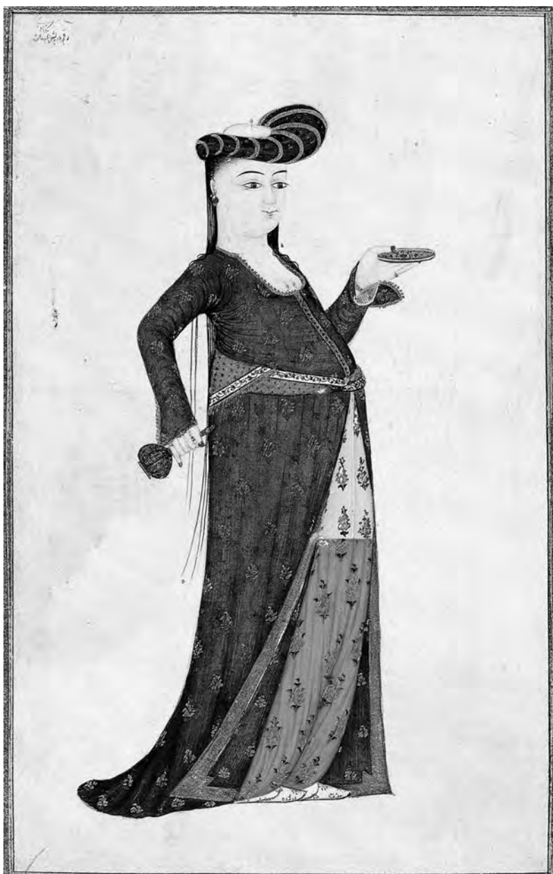
Figure 19.11 An elegant lady from Istanbul, by Abdullah Buhari: Album, Topkapı Palace Museum Library, H. 2143, 11a.