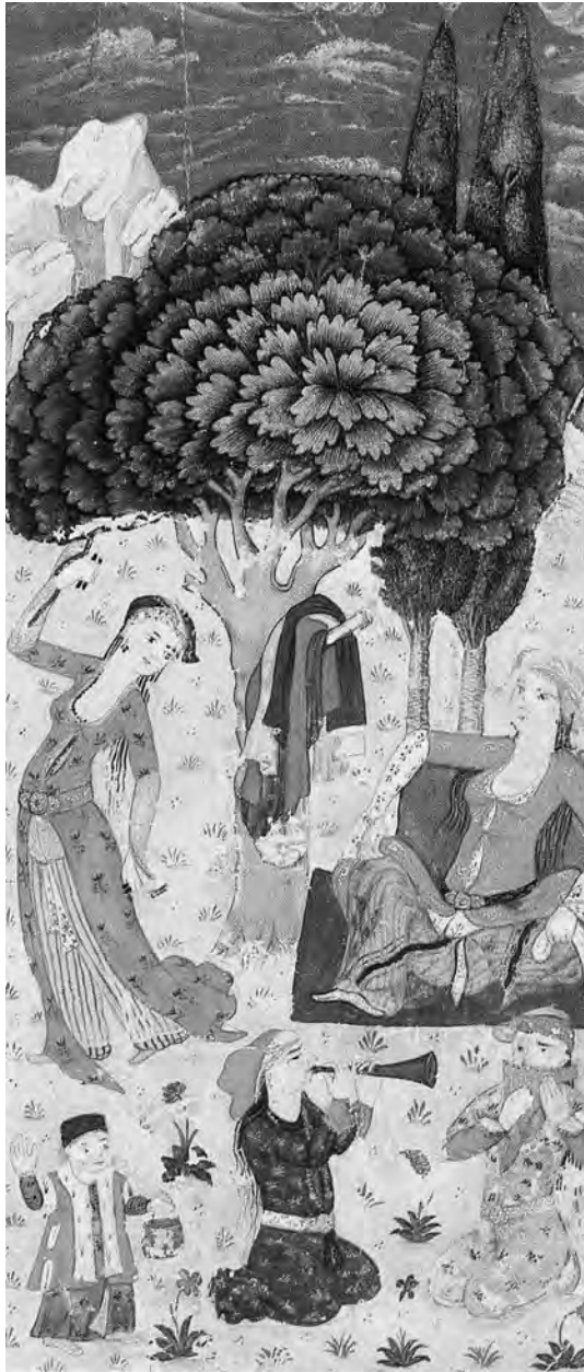
Figure 19.10 A garden party of ladies along the shores of the Bosphorus, by Abdülcélil Levnî: Album, Museum für Islamische Kunst, Staatliche Museen zu Berlin/Georg Niedermeiser, J 28/75, Pl. 430r.