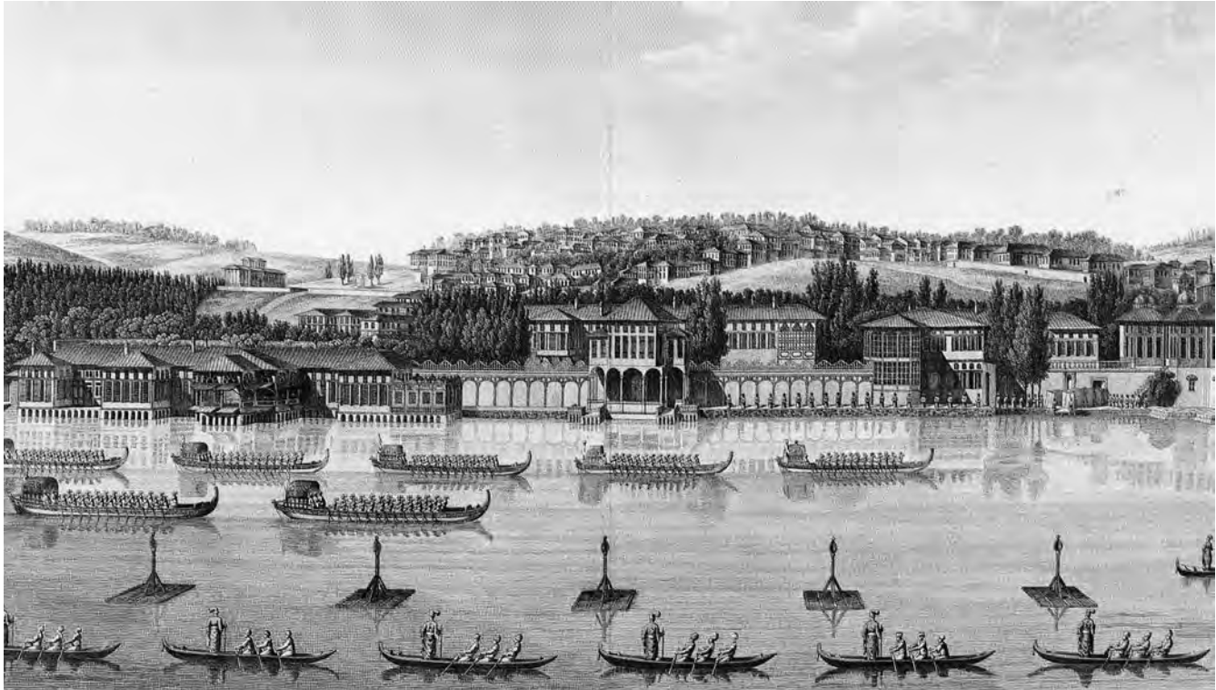
Figure 19.12 Beşiktaş Palace by Espinasse, in Muradgea d'Ohsson, Tableau général de l'empire othoman , Paris, 1824.