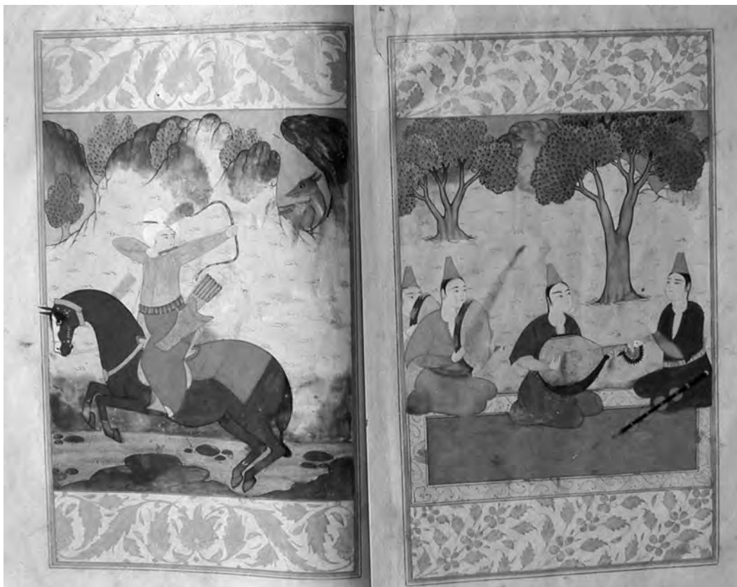
Figure 19.7 A group of musicians at a hunting party: Kitab-i Tuhfetu'l-mülük , Topkapı Palace Museum Library, H. 415, 241b–242a.