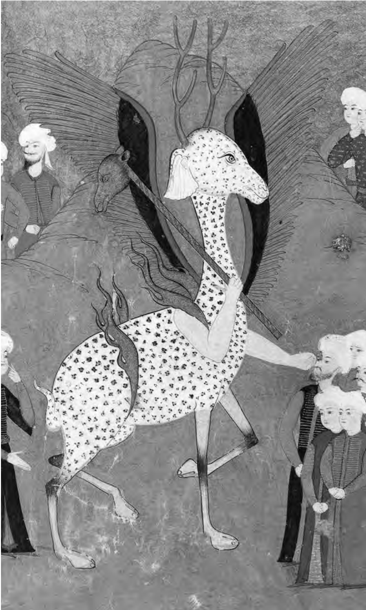
Figure 19.2 Dabbetu'l-arz, an apocalyptic creature: Tercüme-i Cifru'l-câmî , Istanbul University Library, T. 6624, 121b.