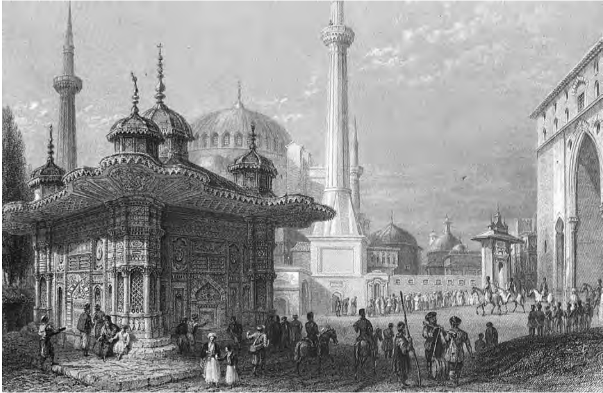
Figure 19.14 Fountain of Sultan Ahmed III and Square of St Sophia by William H. Bartlett, in The Beauties of the Bosphorus by Miss [Julia] Pardoe, London, 1838, pp. 62–3.